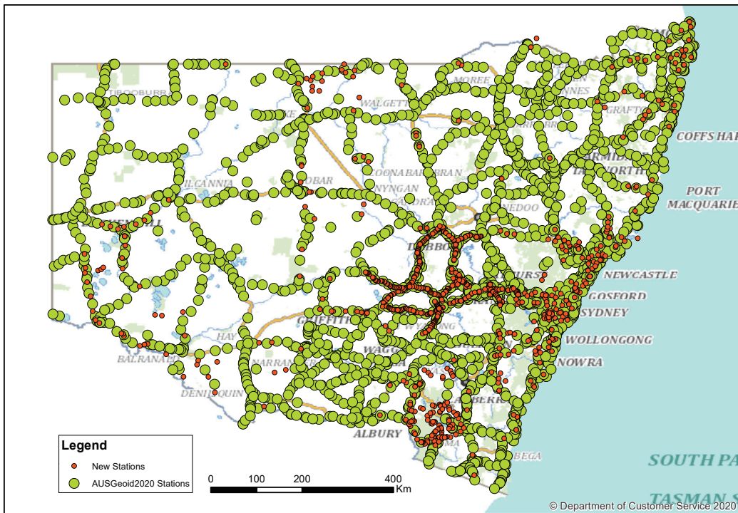
Figure 1: GNSS datasets of at least 6 hours duration on levelled marks observed by DCS Spatial Services, including those contributing to AUSGeoid2020.

the Victorian border, surveyed in the days of the Snowy Mountains Hydro-Electric Scheme (construction from 1949 to 1974).