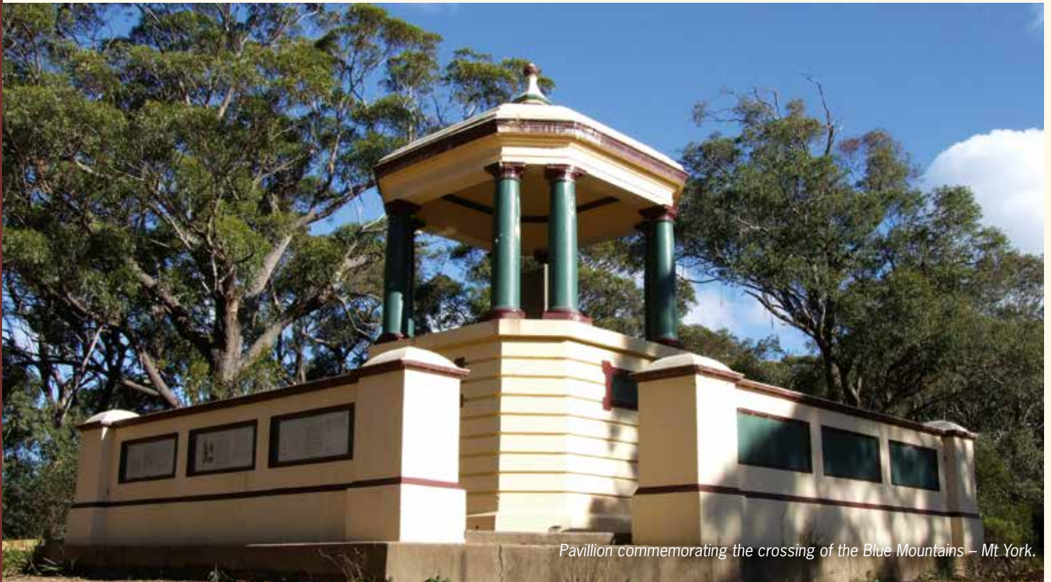
Pavillion commemorating the crossing of the Blue Mountains – Mt York.

While re-construction has brought about improvement in grade and alignment to the original route, one feels that those sections of the road that have been by-passed by modern day engineering should be preserved for future generations as a sample of what was done with hand tools, using manual labour without the back-up logistical resources of food, communication, and medicine, while facing the inclemency of winter weather, with its storms frost and snow, etc.