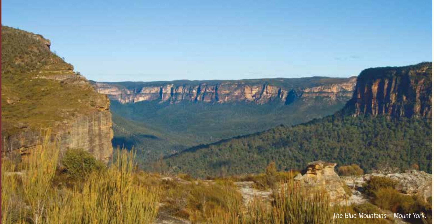
The Blue Mountains – Mount York.