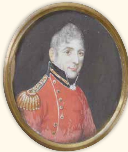
Governor Lachlan Macquarie