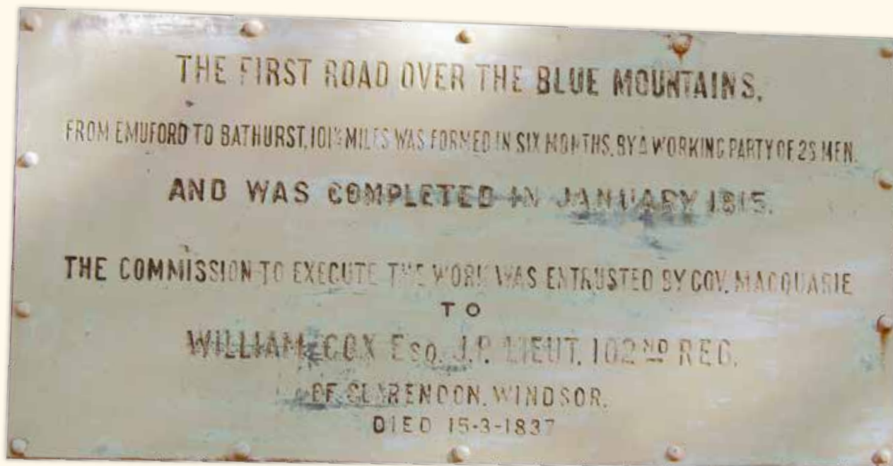
The First Road Over The Blue Mountains Memorial - Mt York

There were no further issues of blankets, although the diary frequently mentions that their blankets were wet and very uncomfortable, as they were sleeping under whatever shelter they could find, and it seems that tents were not provided for them.