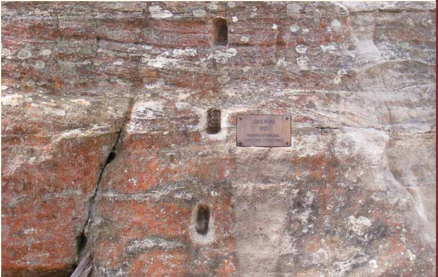
Cox's Road Mount York - remains of original tree rail stock fence

Randall T. who was evacuated to Windsor hospital on 26th September.