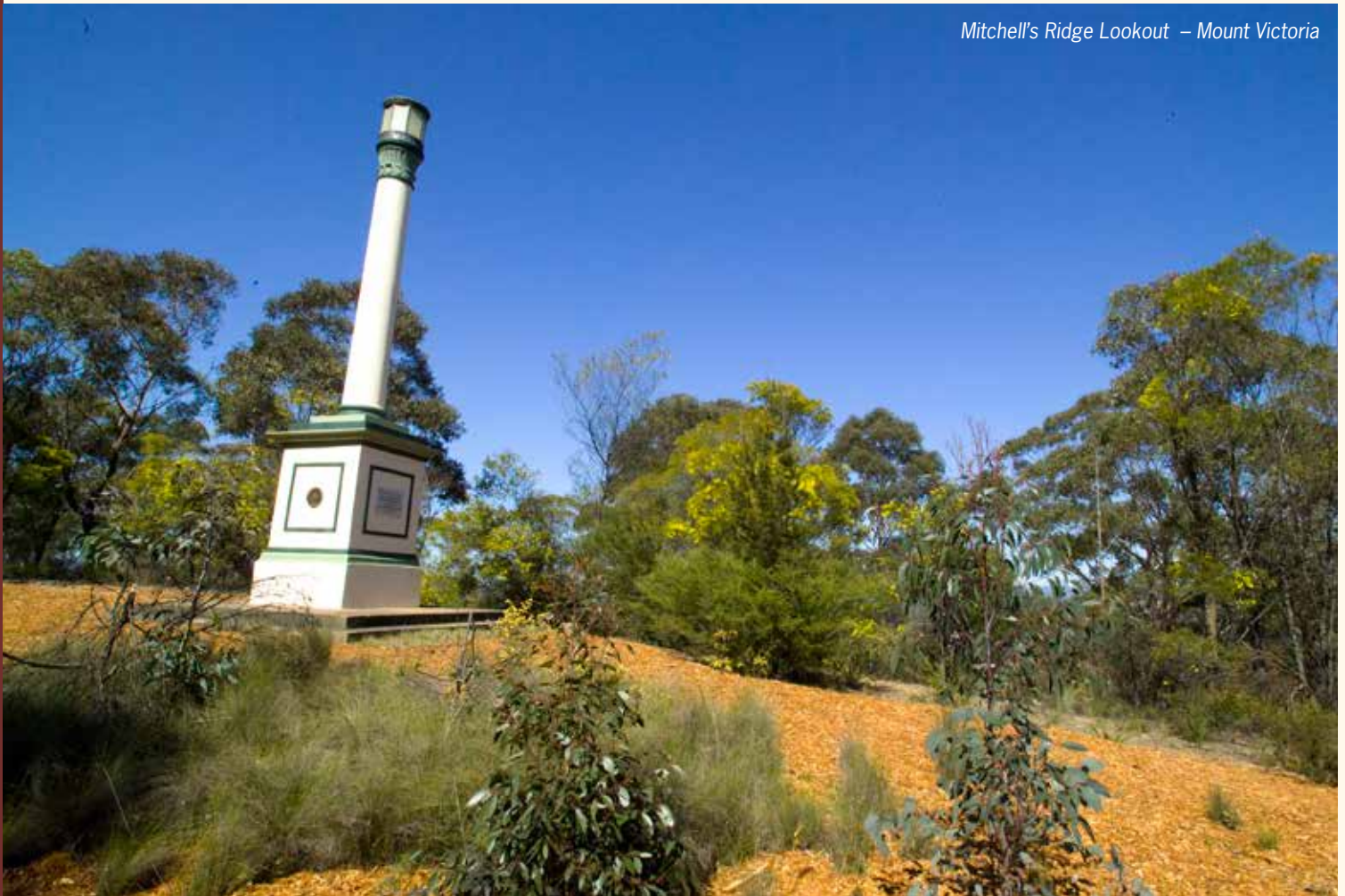
Mitchell's Ridge Lookout – Mount Victoria

The survey would appear to have been carried out with a circumferenter, an advanced form of the magnetic compass and a Gunther’s chain and it can be accepted that this would be accurate to at least half a degree in angle and at least 1 in 1000 in the measurement of length. Based on this the points established by the modern methods would be within 100 to 150 feet (30 to 45 metres) overall, so individual spots would be much more closely defined.