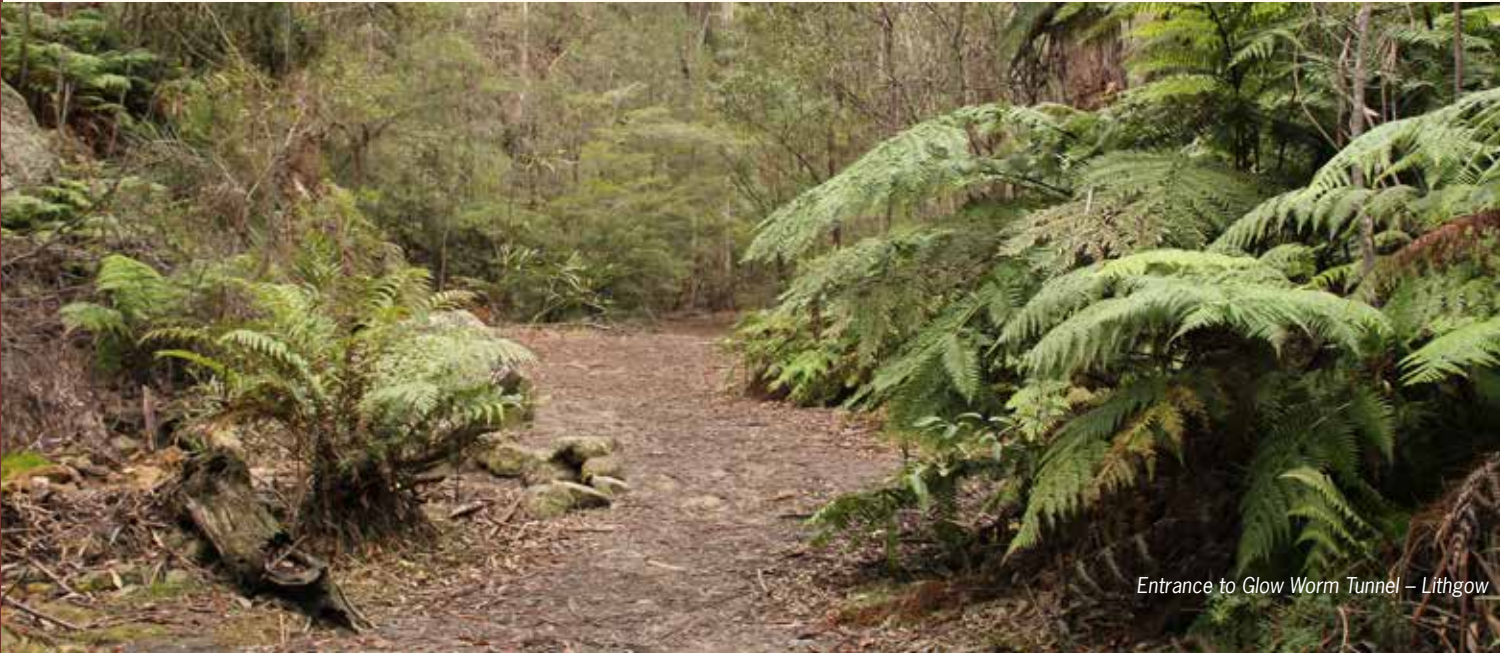
Entrance to Glow Worm Tunnel – Lithgow