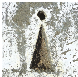
Drill Hole & Wing in Kerb references adjacent boundary corner