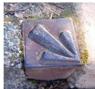
Alignment Pin references road alignment