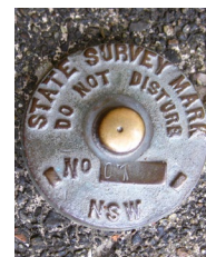
State Survey Mark