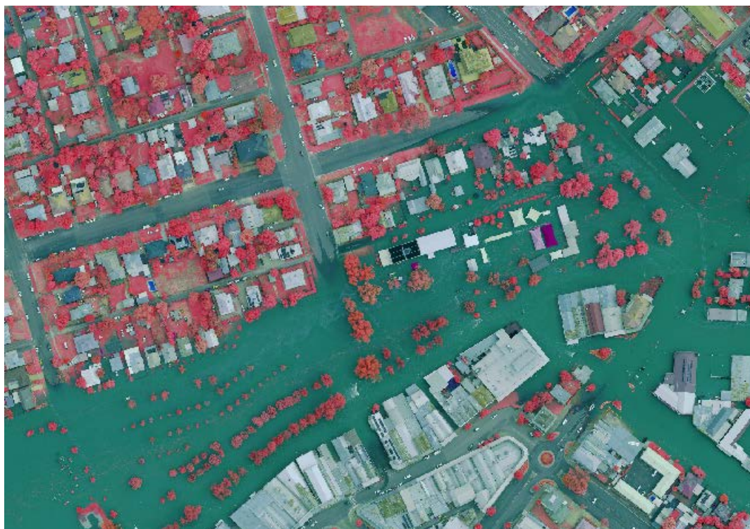
Image 3: 150mm RGBN imagery displayed as false-colour infrared with an NRG band combination