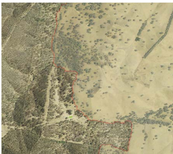
Image 4: Mismatch in terrain reflectance due to differing atmospheric conditions between flight lines

This colour difference can be removed using colour balancing techniques and the placement of seamlines, however there will still be cases in which it will remain visible.